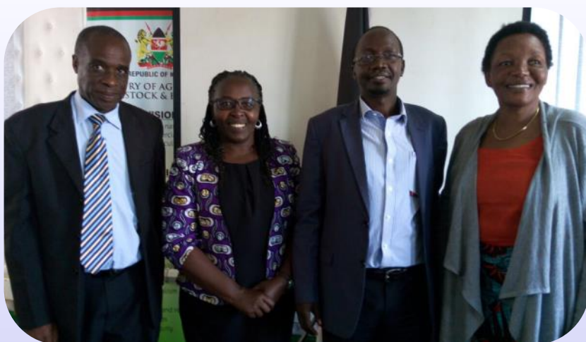
The Executive Committee