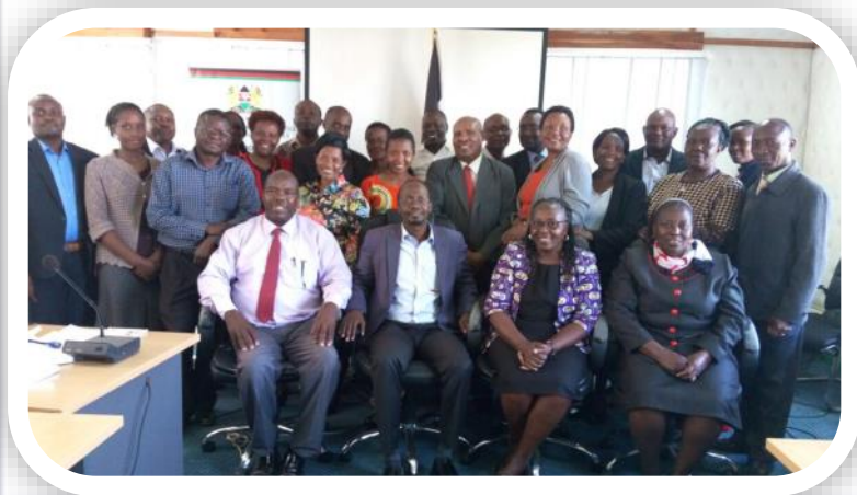
Members Present during the AGM