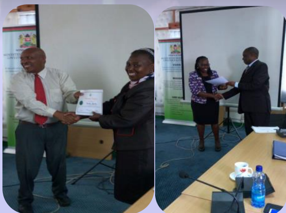
Members Receiving certificates