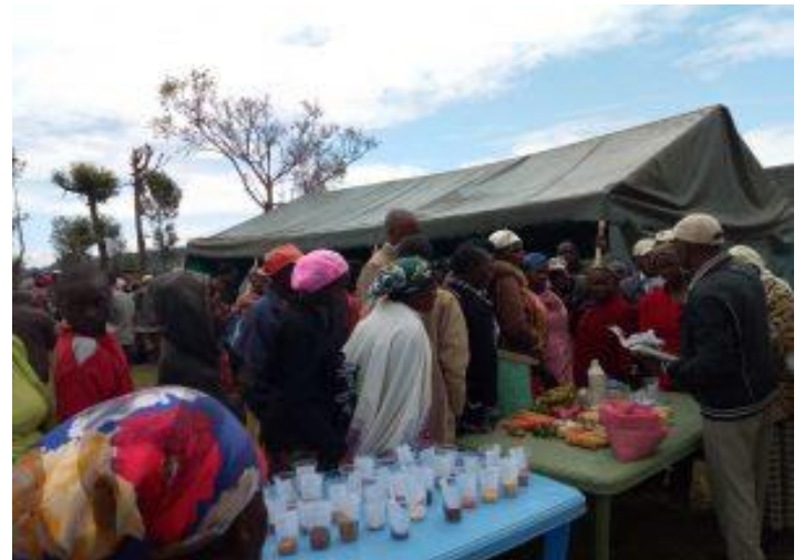
Farmer to farmer trade fair

We recently held annual seed fairs with farmers from Kakamega, Nakuru, Nyandarua and Kiambu County. Various organization which includes; Hivos, Slow Food Kenya, Community Sustainable Development Empowerment Programme (COSDEP) and Resources Oriented Development Initiative (RODI) attended. The event came two months after an international seed fair at Nyando in partnership with Biodiversity international and two weeks after World Organic Congress in India where a farmer from our network and extension officer were sponsored by Hivos and Kenya Biodiversity Coalition (KBOC) to participate. All these gave participants opportunity to learn more on our seed saving concept as well as giving opportunity for farmer-farmer training and mentorship.