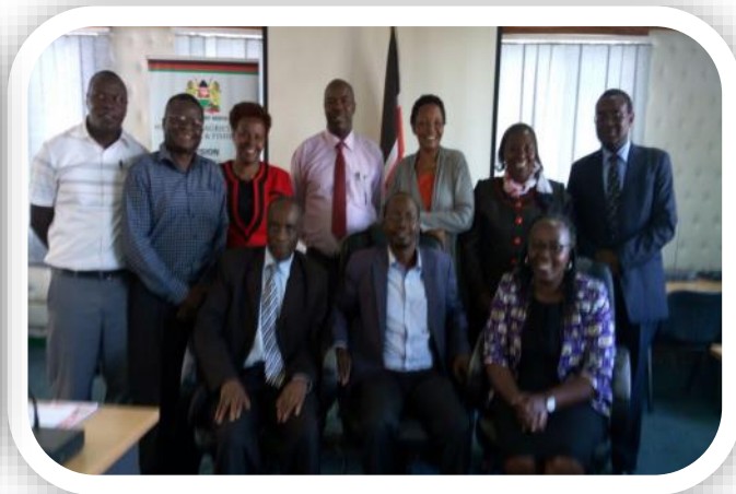
Newly Elected KeFAAS Board