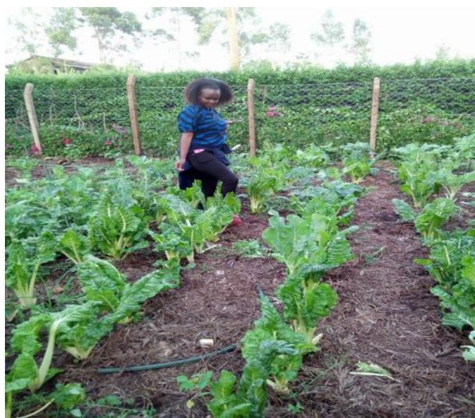
A young woman farmer attending to her vegetable garden

Achieving gender equality and empowering women in agriculture is not only the right thing to do. It is also crucial for agricultural development and food security in Kenya.