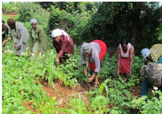
Women farmers attending to their farm in communion

The Kenyan constitution has eliminated gender discrimination in relation to land and property and gives