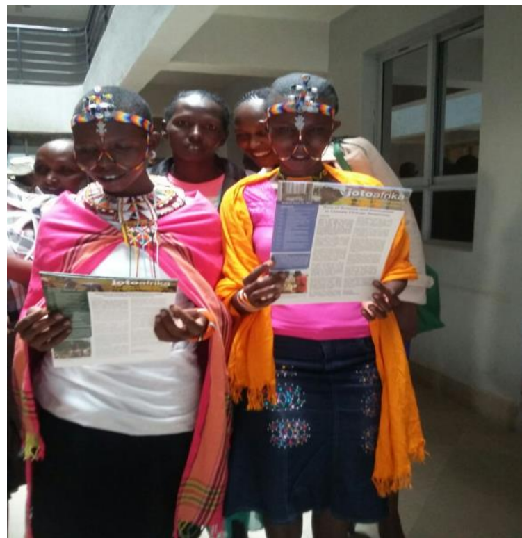
Farmers having a glance at Joto Afrika magazine, this has enhanced their knowledge and experience sharing.

Content for the series includes summaries of African research, community case studies and other relevant information, all presented in a clear, accessible style. The publication focuses on policy lessons and useful practical ideas for adapting to climate change. Each issue considers a different sector or research theme that is affected by climate change.